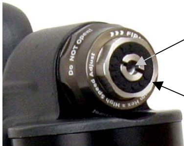
(Figure 2) High and low speed adjusters

Tech Note: When the HSC adjuster is turned clockwise, it will actually back out of the housing. This is due to a left-hand-thread arrangement.