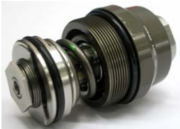
(Figure 1) High-speed piston and preload spring

The DSC valve has two parallel paths through which oil flows. The low-speed circuit is an adjustable needle and jet seat. The high-speed circuit is a valve stack backed by a compression spring. The preload in this spring controls the point at which the valve stack opens (figure 1). These two independent adjusters are shown in the diagram below (figure 2).